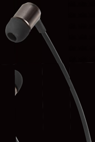
Lenovo In-ear ▶ Headphones