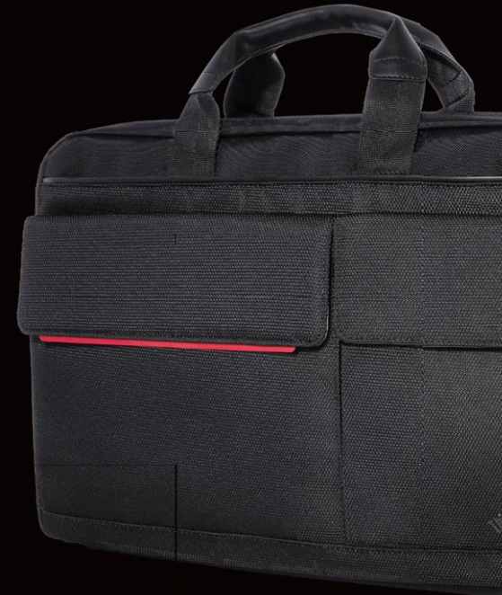
Lenovo Professional ▶ Topload Case