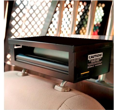
BPJ-VHPM (Ready to Print)

Patented Product (U.S. Pats. 7637566, 7874612, additional patent pending)