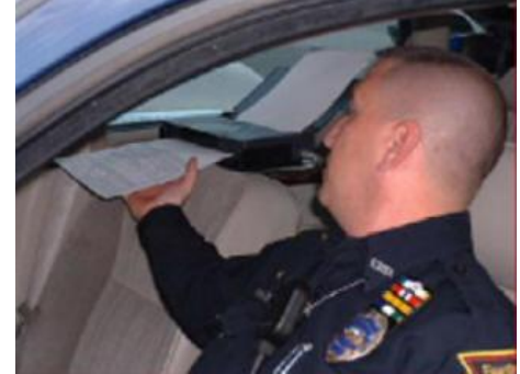
An easy reach for documents

Patented Product (U.S. Pats. 7637566, 7874612, additional patent pending)