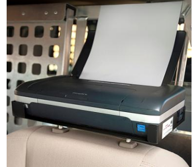
Ready to print

Patented product (U.S. Pats. 7637566, 7874612, additional patent pending)