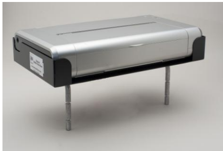
Canon iP100 VHPM

Console Conversion Kit (CCK): 7.0 x 3.0 x 8.0 in; black powder-coated 11 gauge steel L-bracket w/fasteners; weight 2.65 lbs