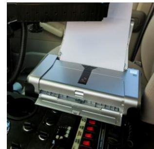
Canon iP100 VCPM