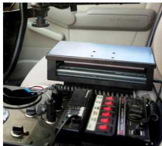
Brother PocketJet BPJ-VHPM